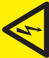
Example of a warning sign in Somali, which states – DANGER HIGH VOLTAGE ELECTRIC BARRIER