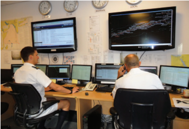
Operations room UKMTO

It is important that vessels and their operators complete both the UKMTO Vessel Position Reporting Forms and register with MSCHOA